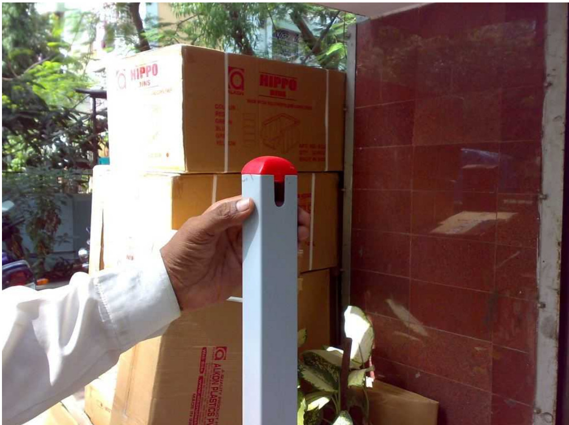
The Red plastic knob on top is to be removed to fit the board.