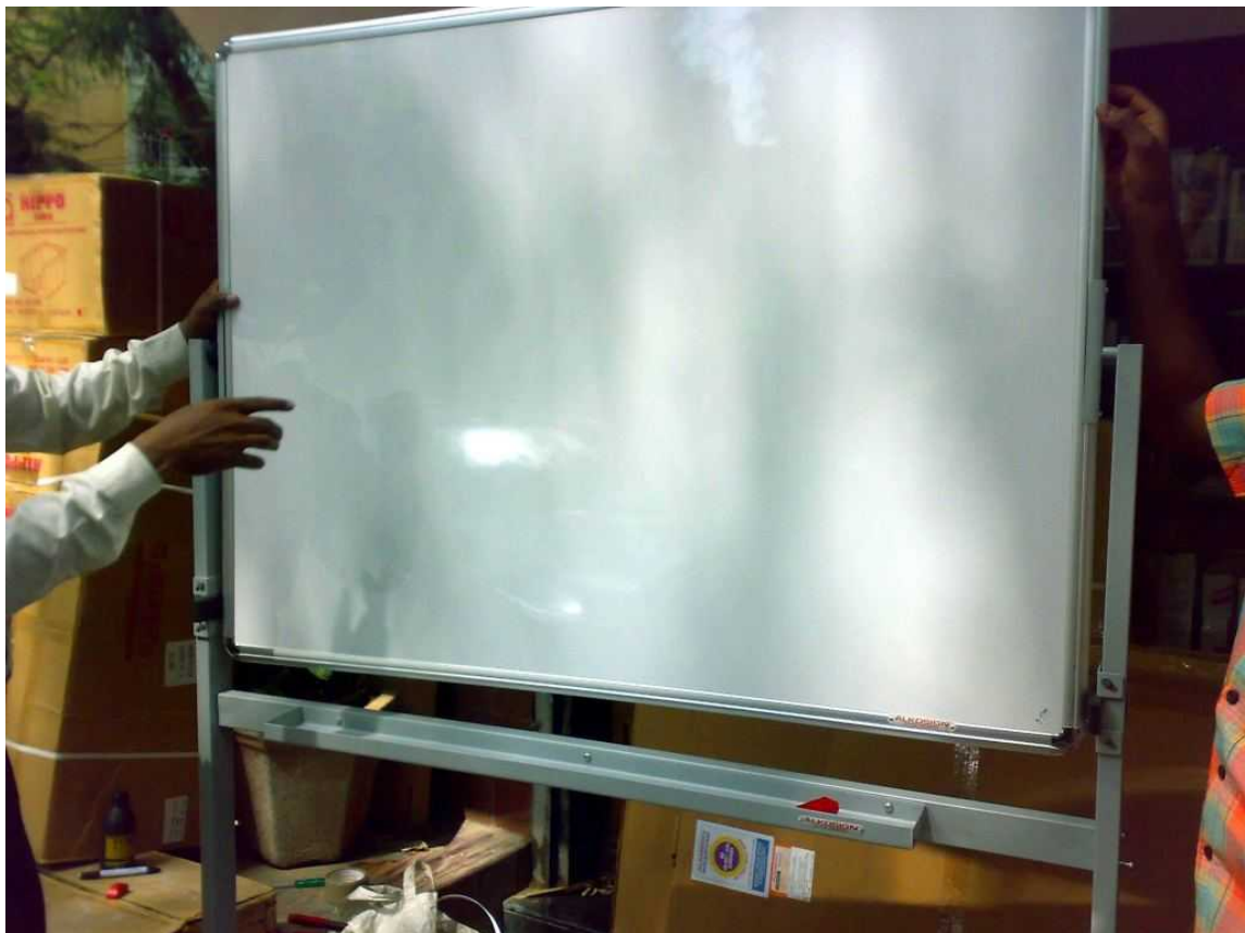
Fix the board in the slots provided Page_4