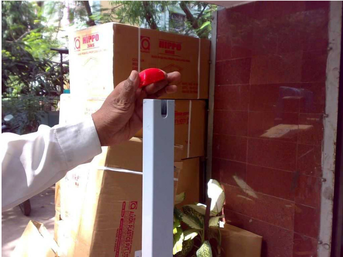
Remove the red Plastic Knobs