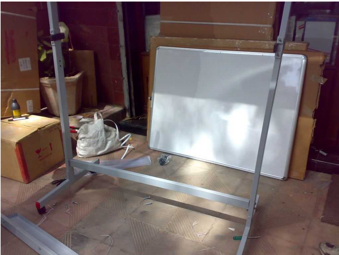
After Fitting the Base Bar on the two Side Posts (Keep the assembly slightly loose)