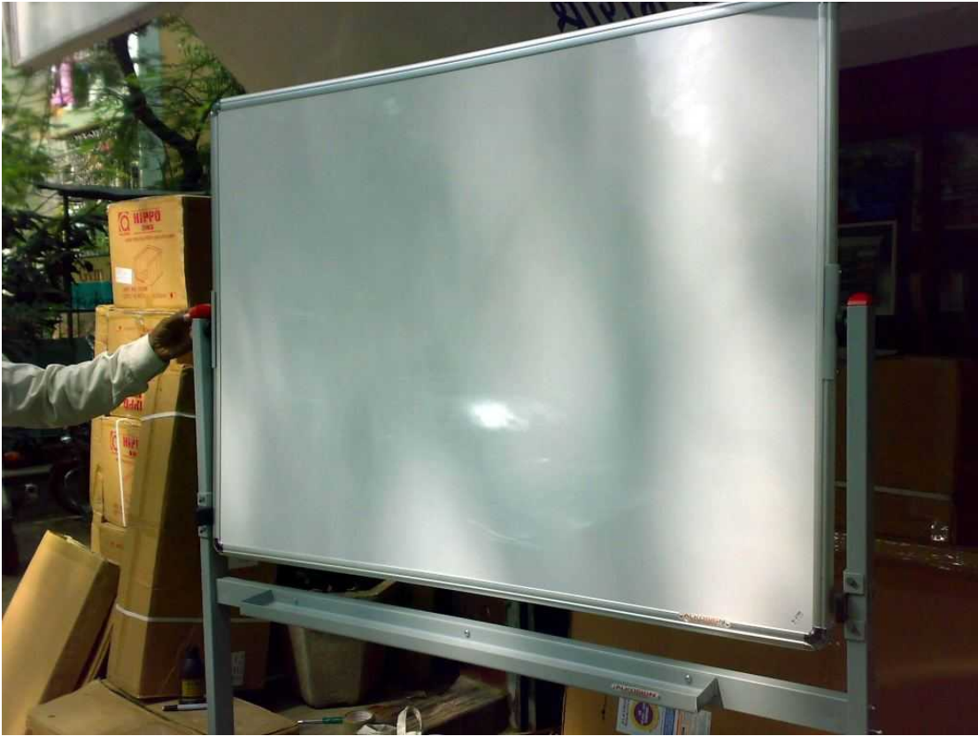
Board fitted in the knobs