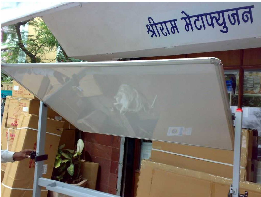
Board can be rotated for use on both sides