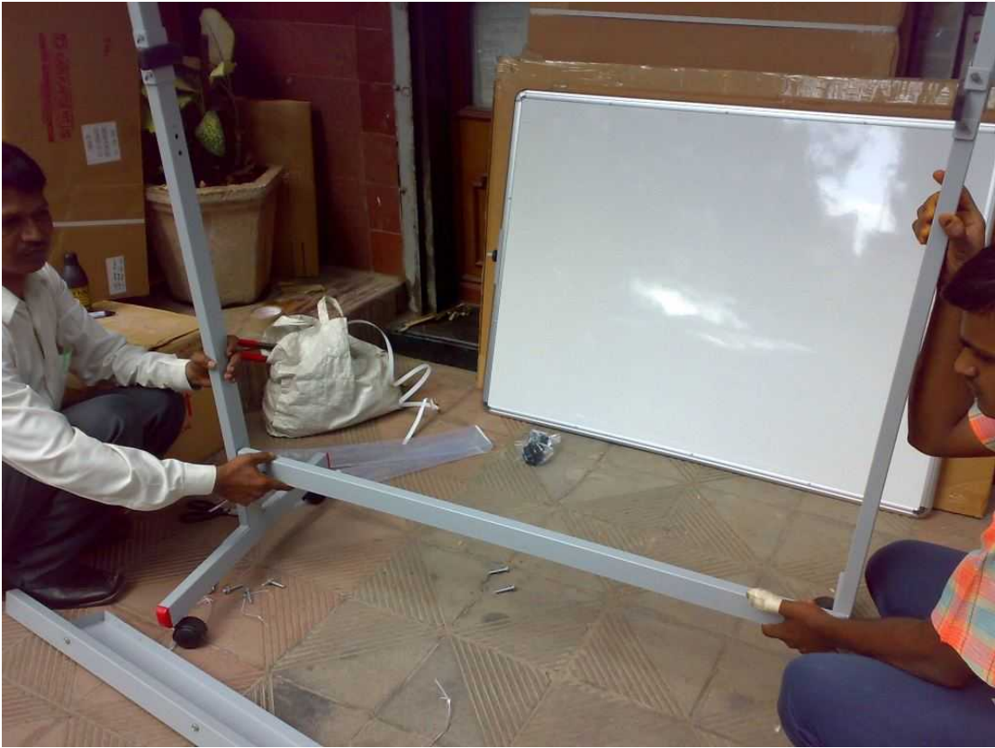
Fix the Base Bar on the 2 Side posts