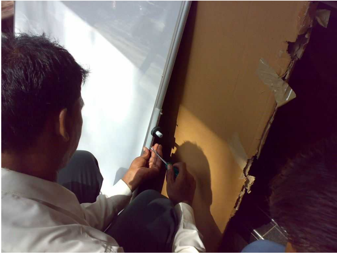
Fitting of bracket on the other side of the board.