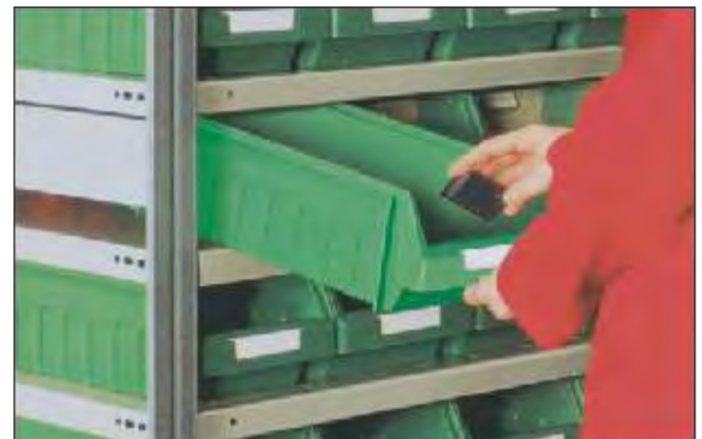
Rear lip for easy access. Stops bin from coming out.

Colours : Red Blue Grey Green Yellow ( For SB-7 Red & Blue only )