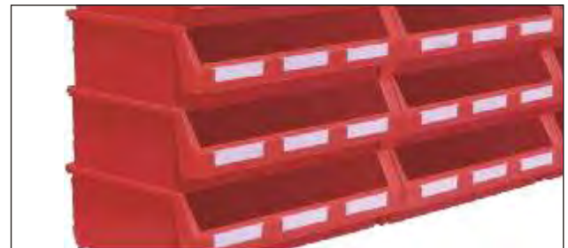
Supra bins are designed to stack one on top of each other.