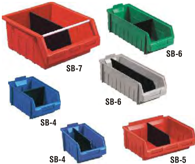
Supra Bins with Partitions