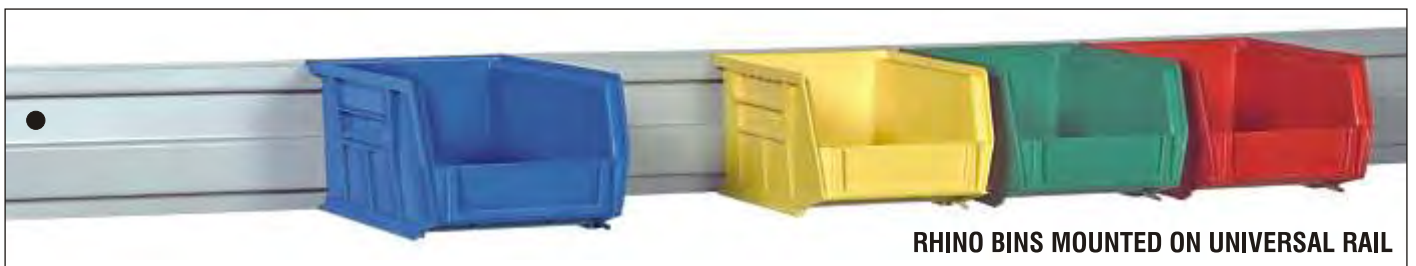
RHINO BINS MOUNTED ON UNIVERSAL RAIL