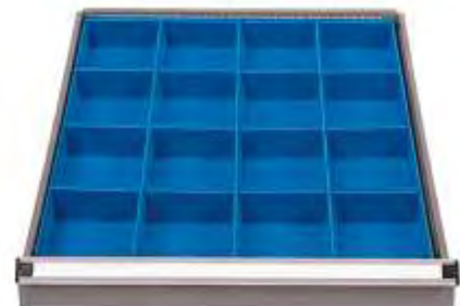
Different combination of containers in use.